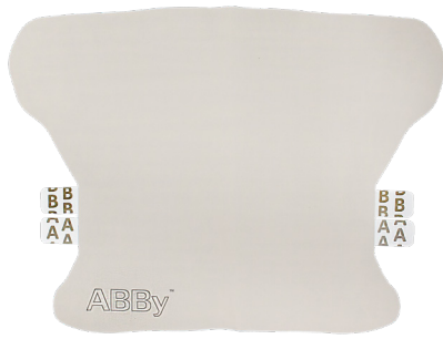
▲ ABBY Panniculus Retraction