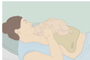
▲ With ABBY

See Instructions for Use for full instructions, warnings, precautions and contraindications.